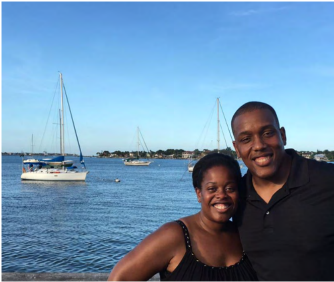
Eploring New Places