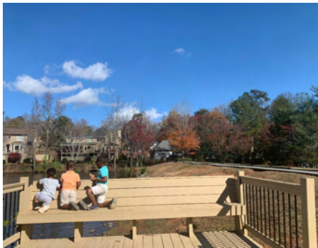
Feeding the ducks