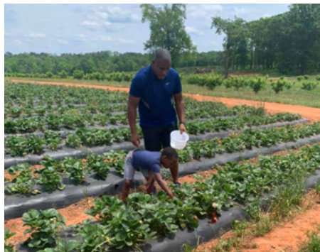
Strawberry Picking At A Nearby Farm