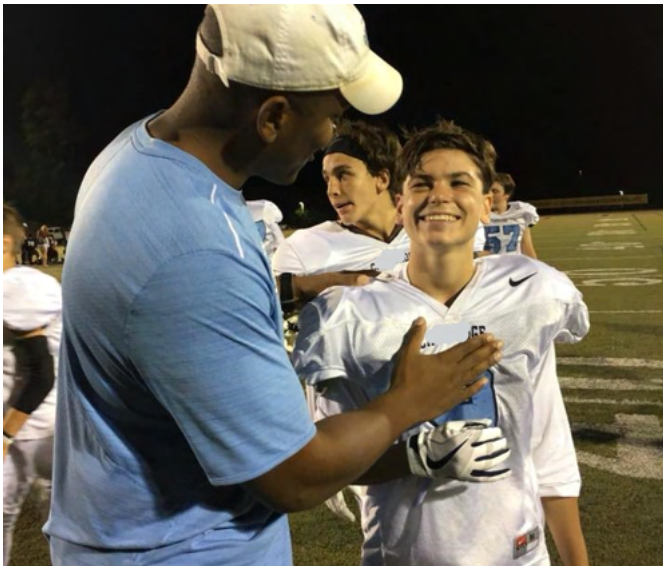
Coach At Heart