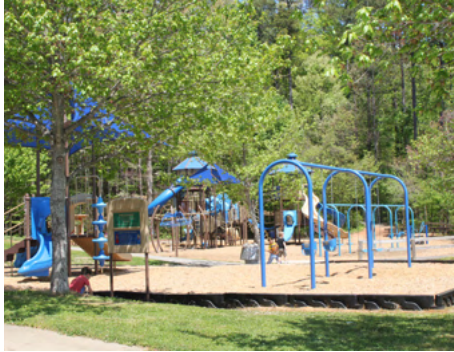
Another Nearby Playgroundy