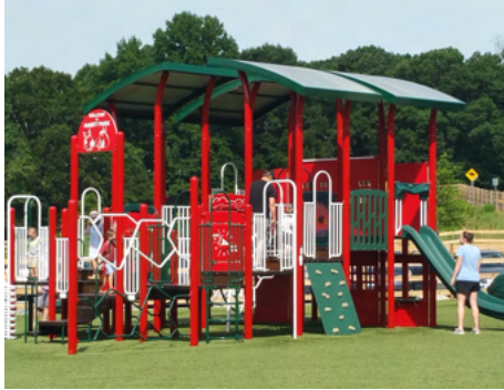
Fun Playground Nearby