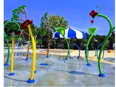
Splish Splash on a Hot Day!