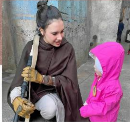
First Trip to Most Magical Place on Earth