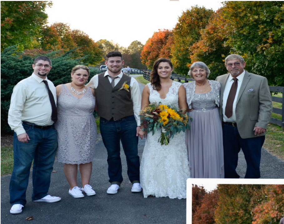
ONE OF OUR FAVORITE DAYS WITH OUR FAMILY