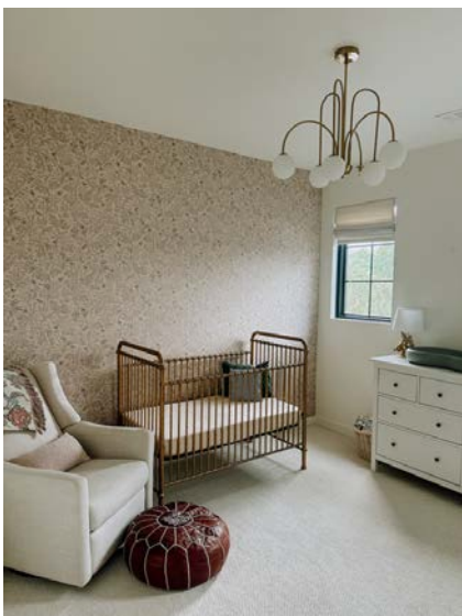
THE NURSERY IN PROGRESS!